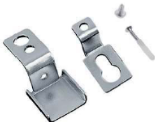
SET MONTAJ TAVAN ZIDARIE