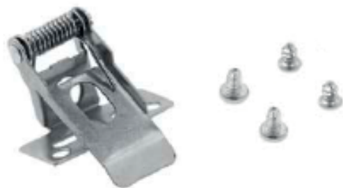
SET MONTAJ PANOULI INCASTRAT