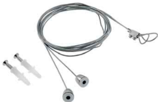
KIT DE SUSPENSIE 1,5m