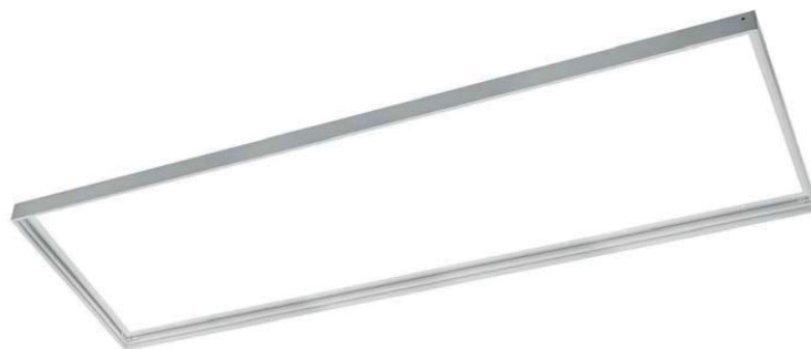
RAMA MONTAJ APARENT: